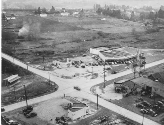
Bellevue Way & NE 8<sup>th</sup> Street, looking south-east, 1937 & 2007.

Eastgate. By 2000 Bellevue had more jobs than residents, ending its status as a bedroom community. Microsoft has become the city's largest employer, having absorbed a large part of the new downtown office space built during the 2000s.