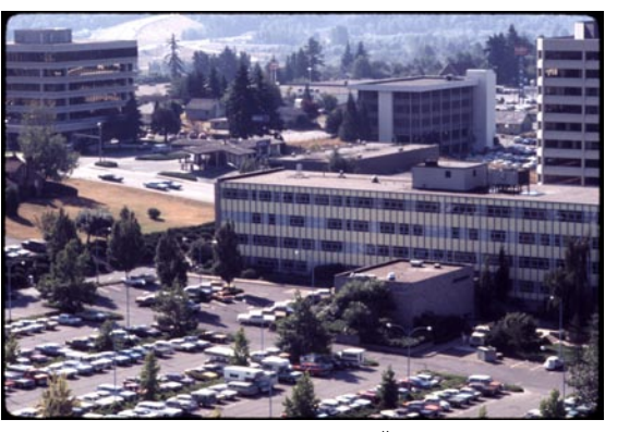
Puget Power Building on NE 4<sup>th</sup> Street, circa 1969.

Eastgate. By 2000 Bellevue had more jobs than residents, ending its status as a bedroom community. Microsoft has become the city's largest employer, having absorbed a large part of the new downtown office space built during the 2000s.