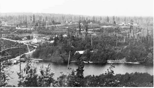
Meydenbauer Bay, Bellevue, circa 1910.

In the 1870s and 1880s more settlers trickled over. Most of the area was logged off during this period, leaving open areas that became orchards, vegetable patches and berry farms. Fast-growing Seattle needed a regular supply of fresh produce, and Bellevue provided it. Regular ferry service began in the 1880s, linking Eastside communities with markets in Seattle through Leschi and Madison Park. Most of the farmers had families, and Bellevue's first school opened in 1883 in a log cabin in the Enatai area.