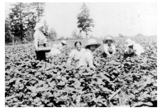
Takeshita Strawberry Farm near Lake Bellevue, 1930s.

arrive, with phone service reaching the Eastside by 1907 and mercantile stores opening in Medina and Bellevue. The major change came in 1913 when car ferry service aboard the Leschi began. Trips left the Leschi dock in Seattle every 15 minutes and stopped at Medina and Meydenbauer Bay.